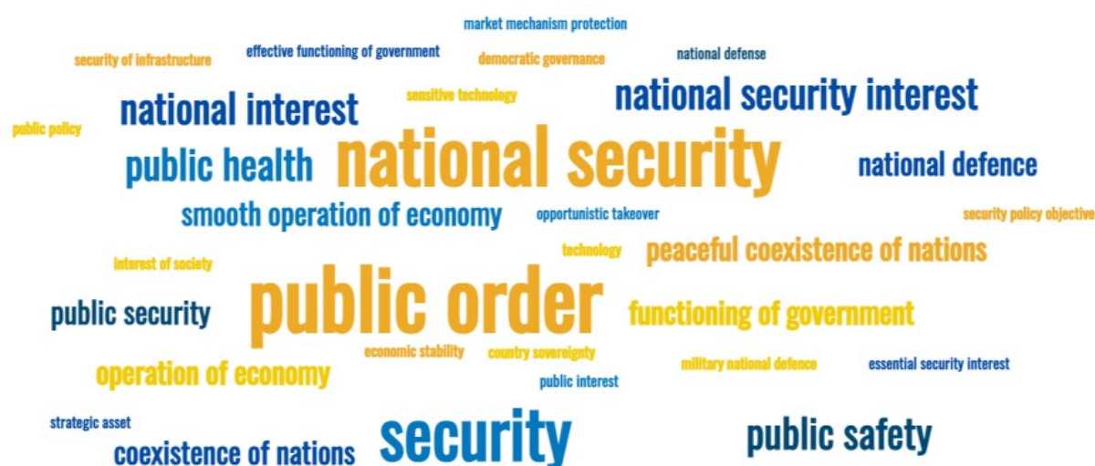
Figure 2. Investment screening rationale

Detailed information about the rationale or criteria behind the screening process is provided by all analyzed countries except for two. In the wide range of criteria put forward, “public order” is the main screening criterion for 11 countries, while “national security” and “national interest” are offered as the key rationale in 6 and 5 countries respectively. Five countries provide more than one criterion (figure 2). The same criteria, however, can have different definitions depending on the regime considered. 7 This is not surprising, as essential security concerns are self-judging and each country has a right to determine what is necessary to protect its national security (OECD, 2009). The existence of such a wide range of often undefined criteria, however, can be a source of uncertainty for investors, with potentially deterrent effects on FDI.